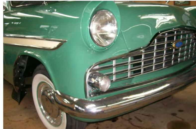
The car is running on conventional crossply tyres with clip on white walls.

Congratulations to both couples, and our thanks go to the Mackenzie Country Inn for their generous donation of the prizes