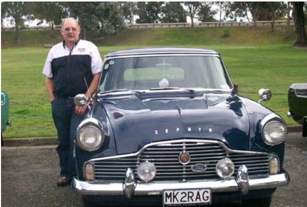
Best Mk II Phil Rooke Mk II Convertible